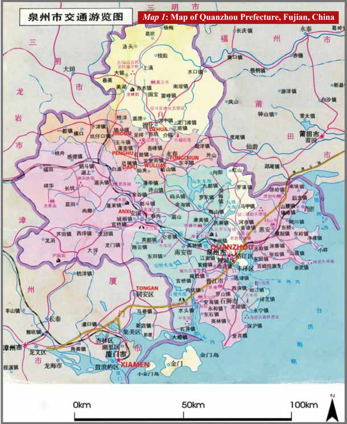
Map 1: Map of Quanzhou Prefecture, Fujian, China